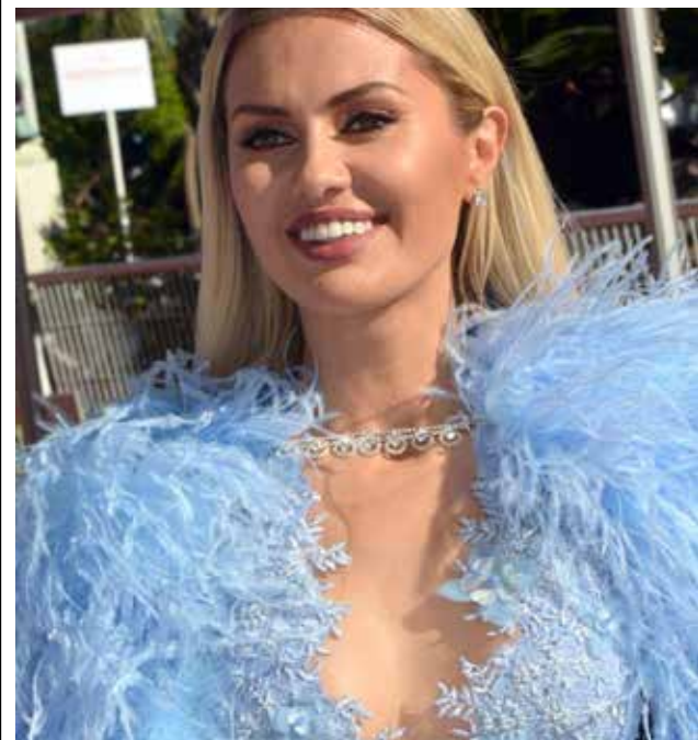
Victoria Bonya.

Creative Commons Attribution-Share Alike 3.0