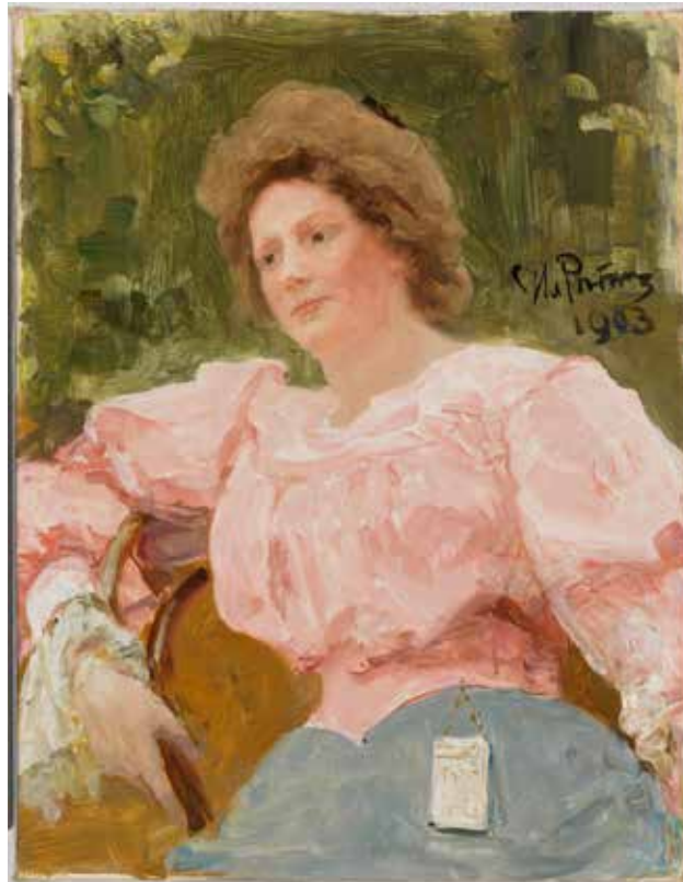
Ilya Repin 24.7.1844, Tšugujev 29.9.1930, Kuokkala nyk. Repino, Venäjä Young Woman in Rose Blouse, 1903 Finnish National Gallery Collection / Ateneum Art Museum, Wäinö Walli Collection

Research highlights risks linked to heavy use, including sleep problems, reduced concentration and mental health challenges.